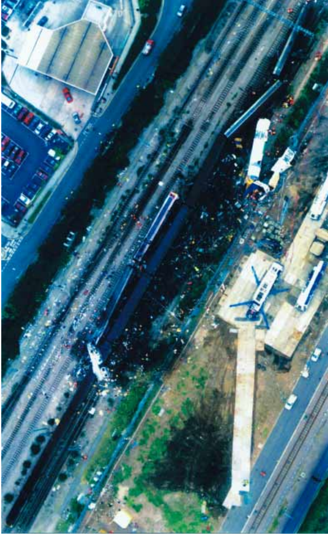
Plate 16: Aerial view of crash site taken on 7 October 1999.