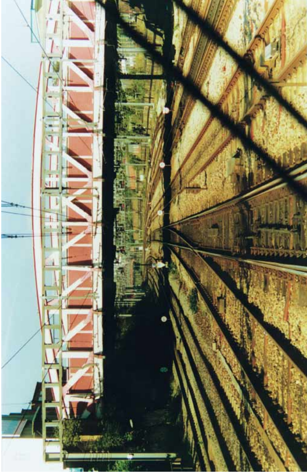
Plate 3: Gantry 8 at a distance of 188 metres. Taken from the driver's position in a Class 165 Turbo on the Line 4 to Line 3 crossover.