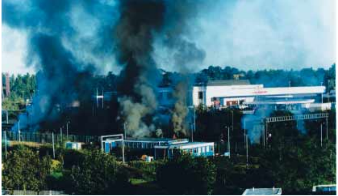
Plate 9: Early stage of the fire in coach H of the HST: view from the south.