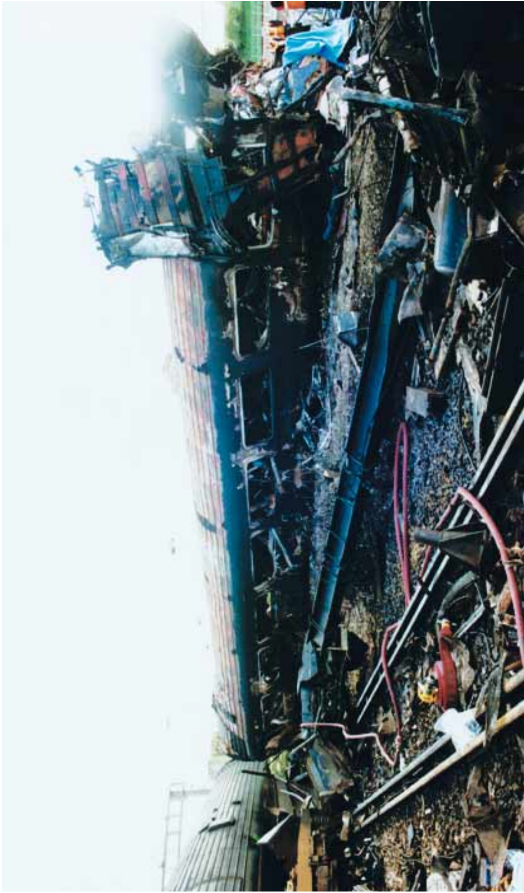
Plate 12: Coach H of the HST: view from the west.