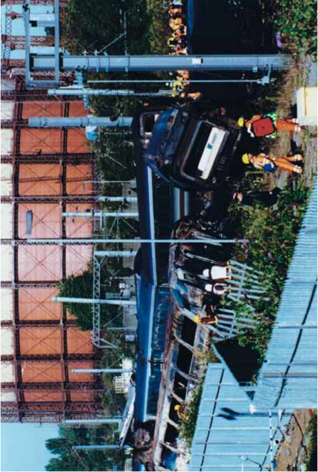
Plate 11: Crash site showing coaches F and H of the HST: view from the south-east.