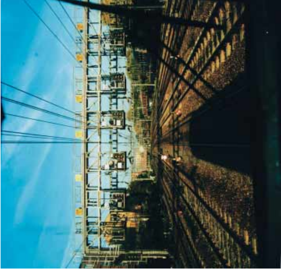
Plate 6: Gantry 8 at a distance of 17 metres. Taken from the driver's position in a Class 165 Turbo on Line 3, under conditions of bright sunlight, at about 08:14 on 6 October 1999.