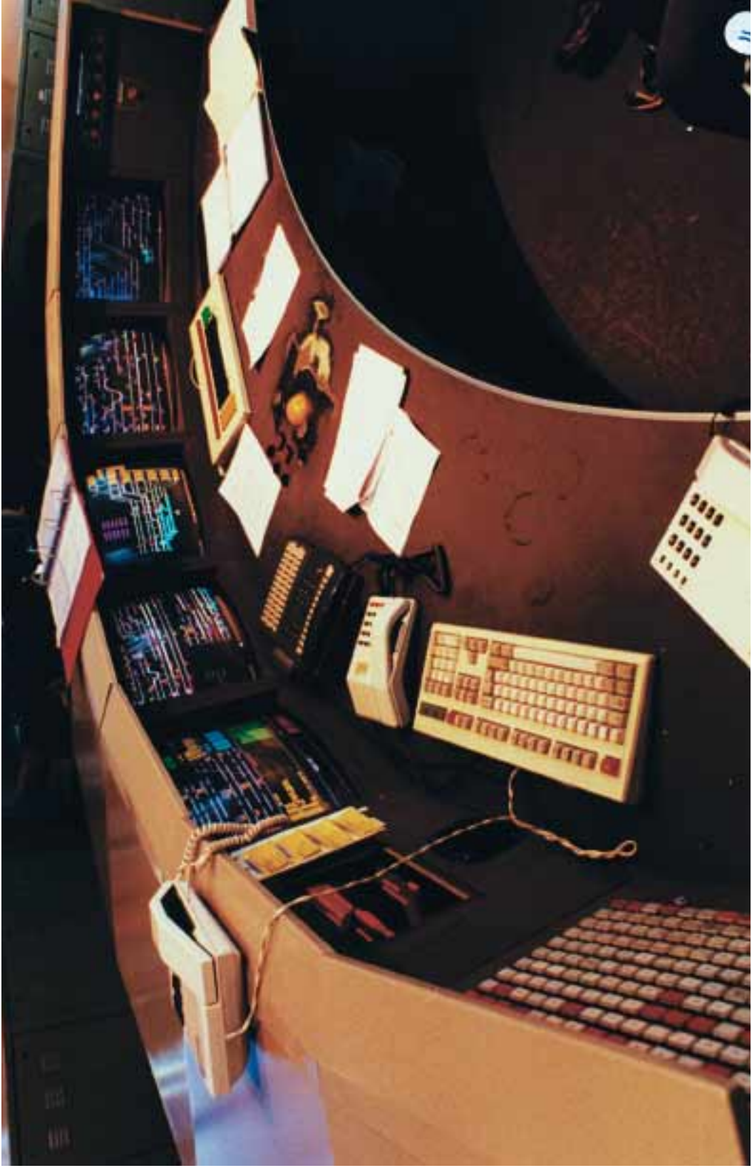
Plate 15: Workstation at IECC, Slough.