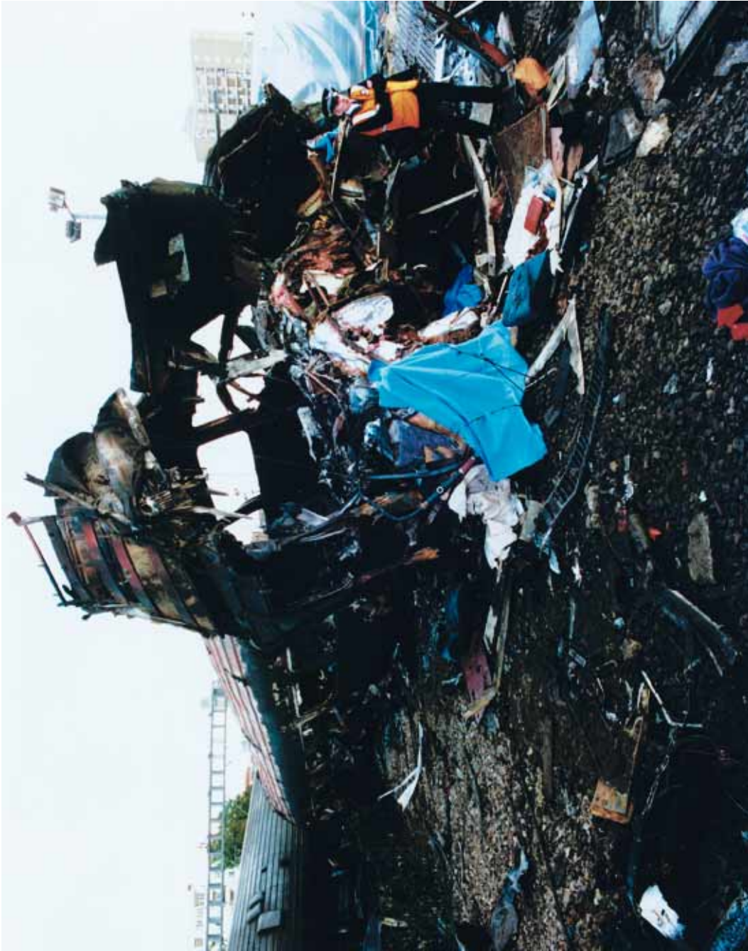
Plate 13: Coach H of the HST: view from the west.