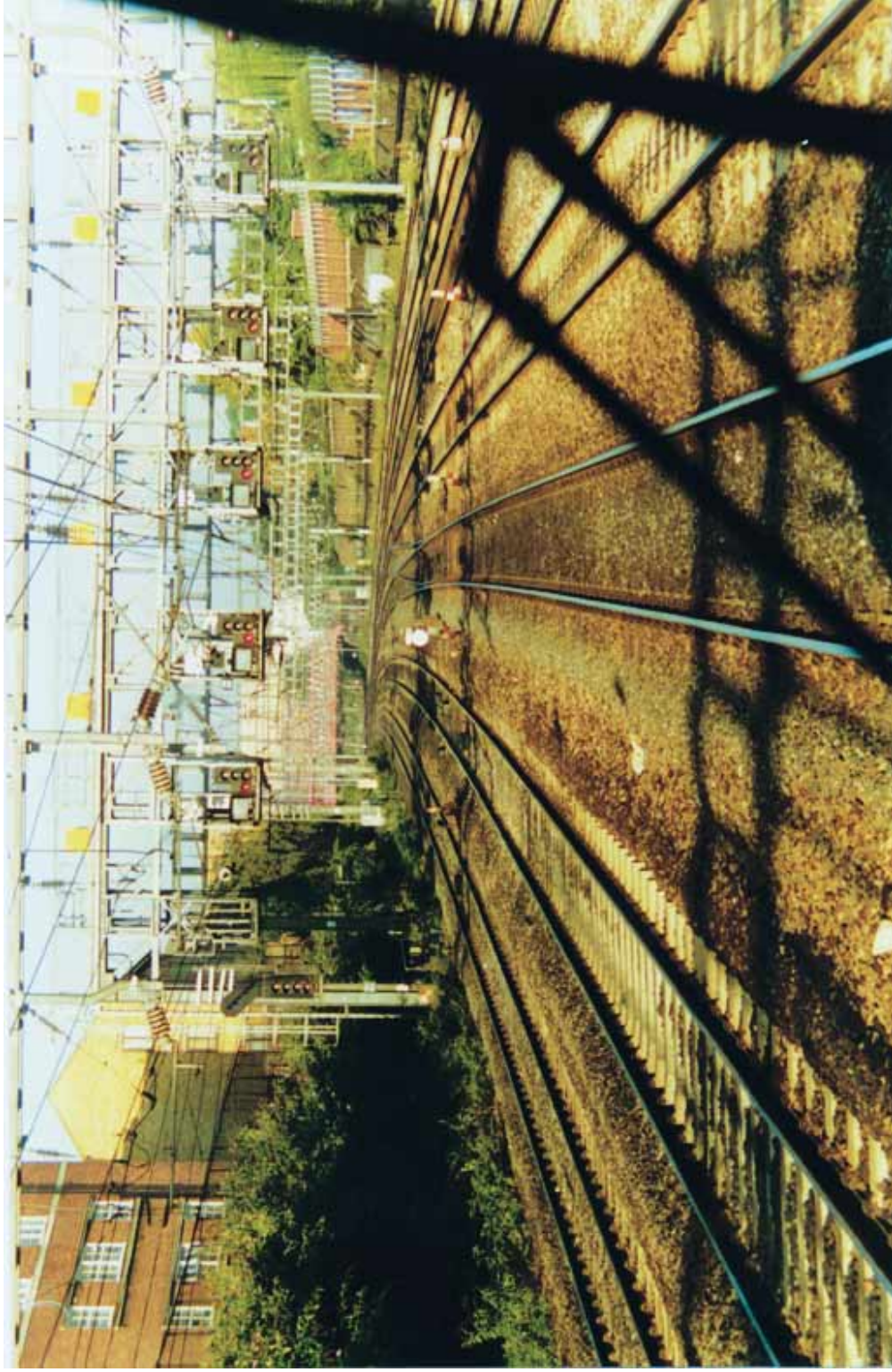
Plate 5: Gantry 8 at a distance of 60 metres. Taken from the driver's position in a Class 165 Turbo on Line 3, under conditions of bright sunlight, at 08:51 on 6 October 1999.