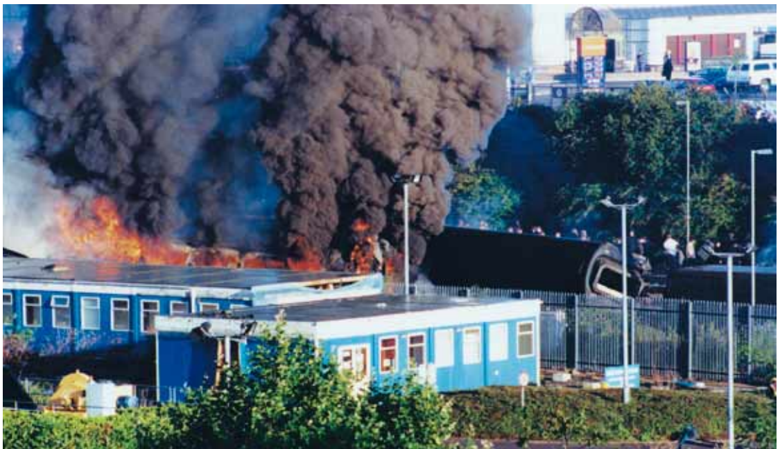
Plate 10: Later stage of the fire in coach H of the HST: view from the south.