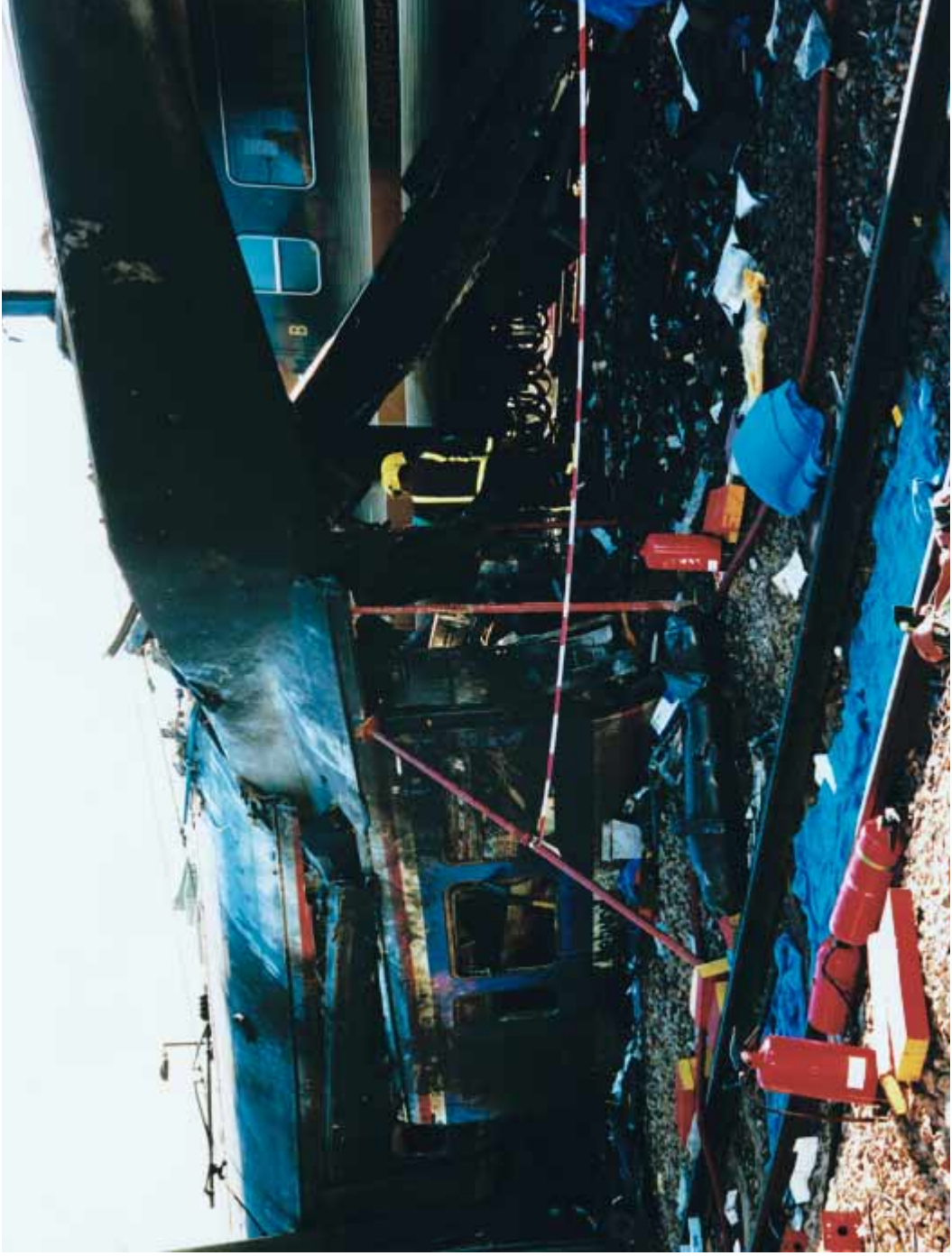
Plate 8: Front and middle cars of the Thames Turbo: view from the north.