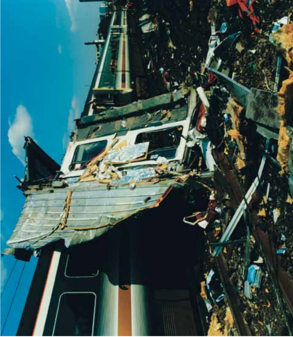
Plate 7: Part of the front car of the Thames Turbo against coach B of the HST: view from the west (south side of crash).