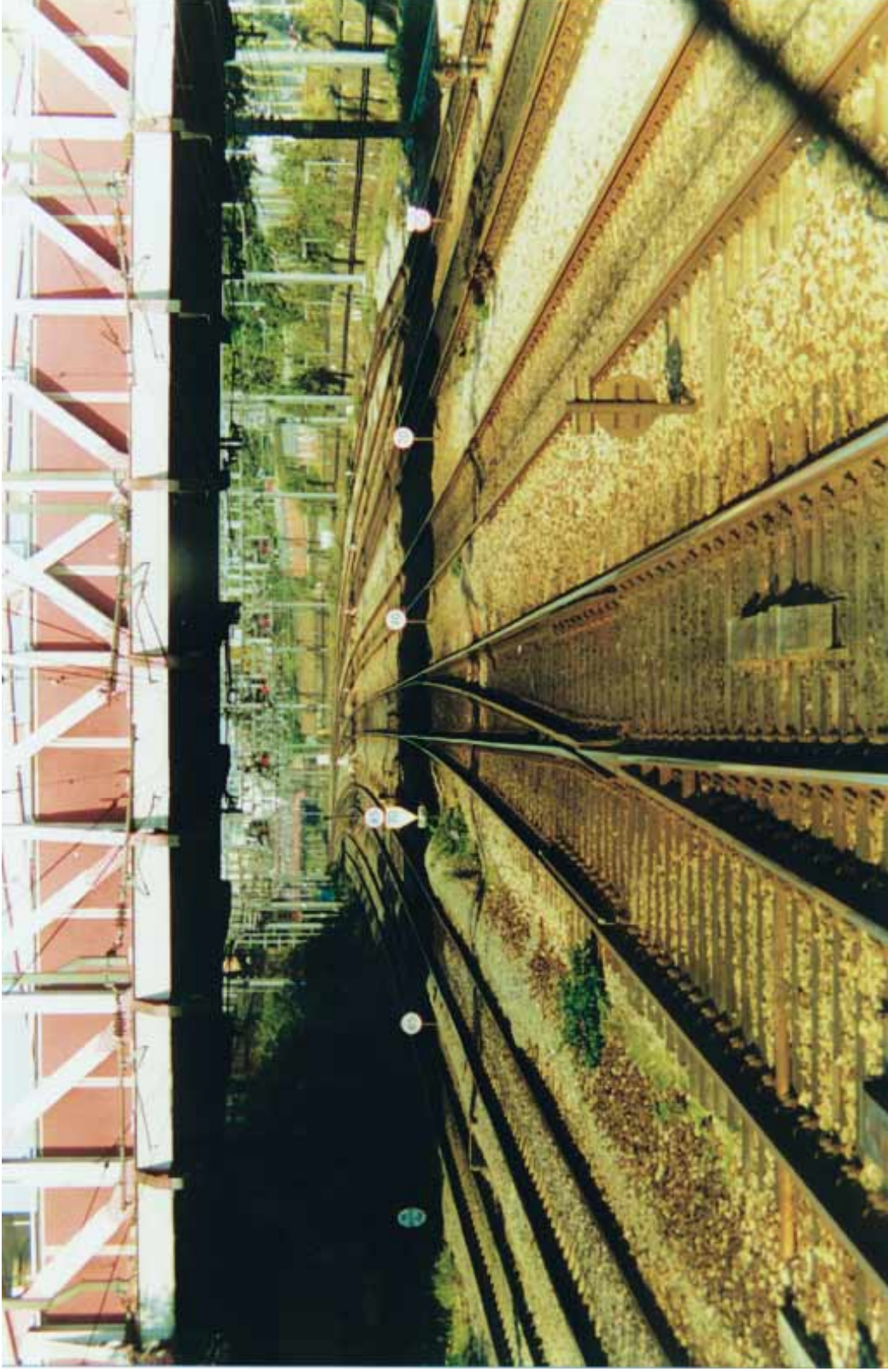
Plate 4: Gantry 8 at a distance of 168 metres. Taken from the driver's position in a Class 165 Turbo on Line 3.