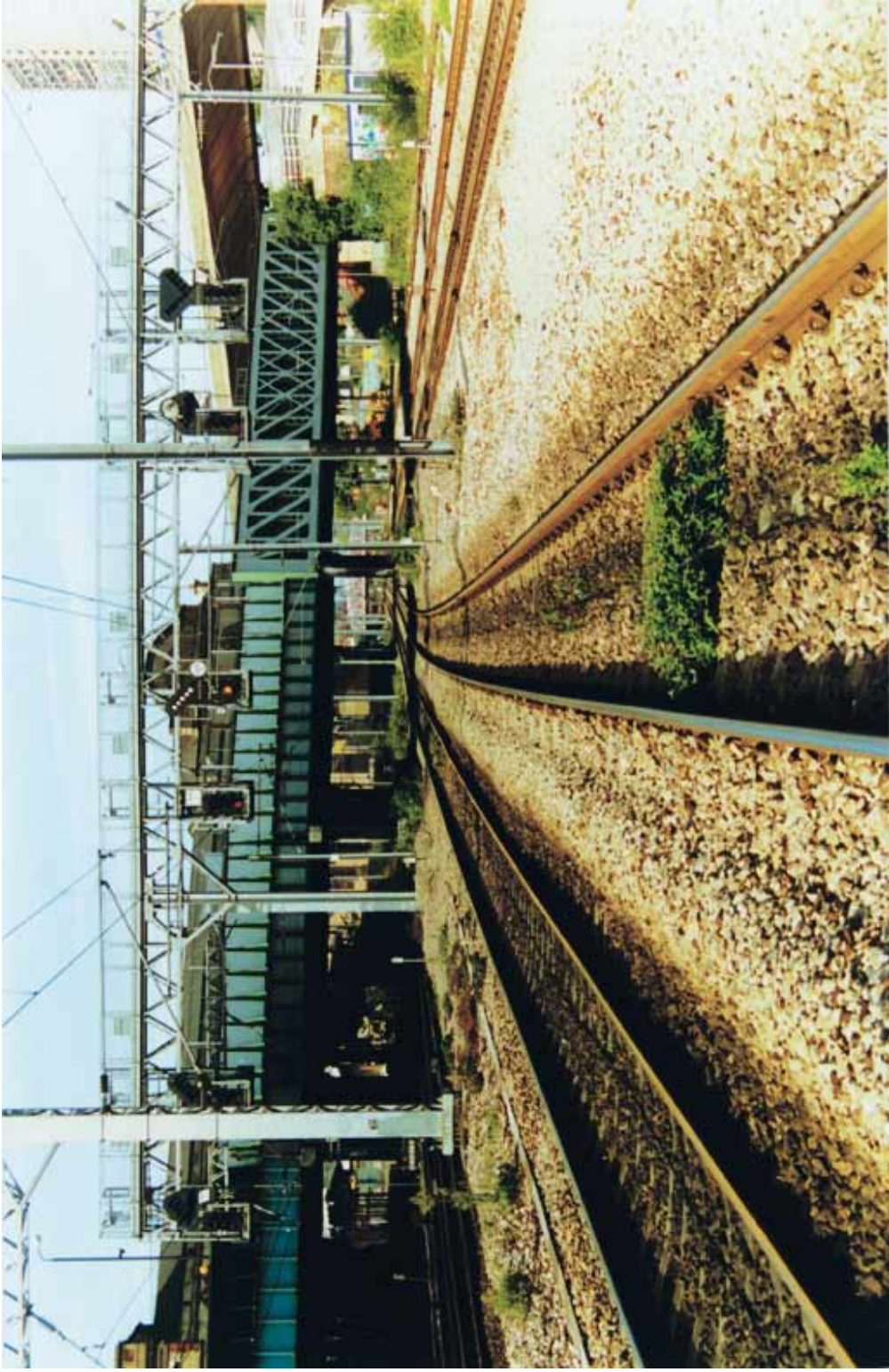
Plate 1: Gantry 6 showing, from left to right, signals SN81, SN83, SN85, SN87, SN89 and SN91. Taken from ground level on Line 4, to which SN87 applies.