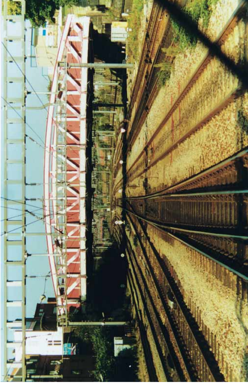
Plate 2: Gantry 8 at a distance of 218 metres. Taken from the driver's position in a Class 165 Turbo on the Line 4 to Line 3 crossover. Its signals, from left to right, are SN107, SN109, SN111, SN113 and SN115. SN105 is carried by a post at the trackside.