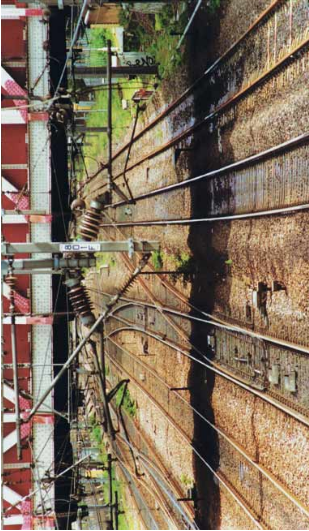
Plate 14: View towards Paddington. Taken from Gantry 8 with the camera placed directly above the red aspect of SN109. The lines are numbered 1 to 6 from right to left. SN109 applies to Line 3.